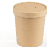
Soup Cups With LIDS