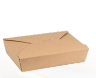
Paper Takeout Container