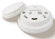
Paper Hot Lid