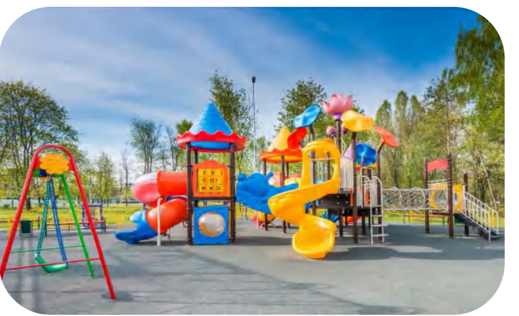
Yonglang Products Showtime