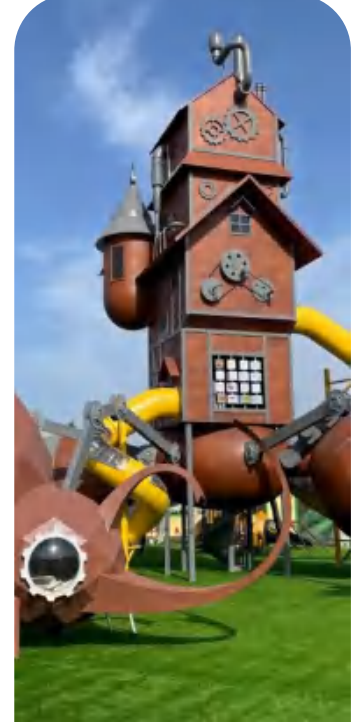
Visit www.yonglang.com to know more.