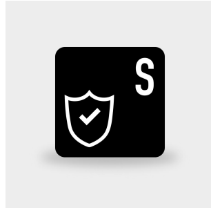
Industry software Industrial-Software BRAIN2 Safety_Service