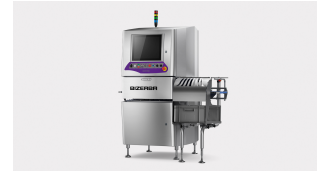
Inspection systems Vision inspection system PackSecure