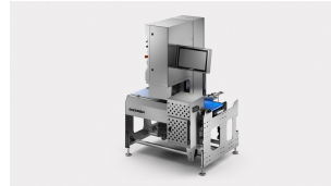
Inspection systems Vision inspection system SealSecure basic