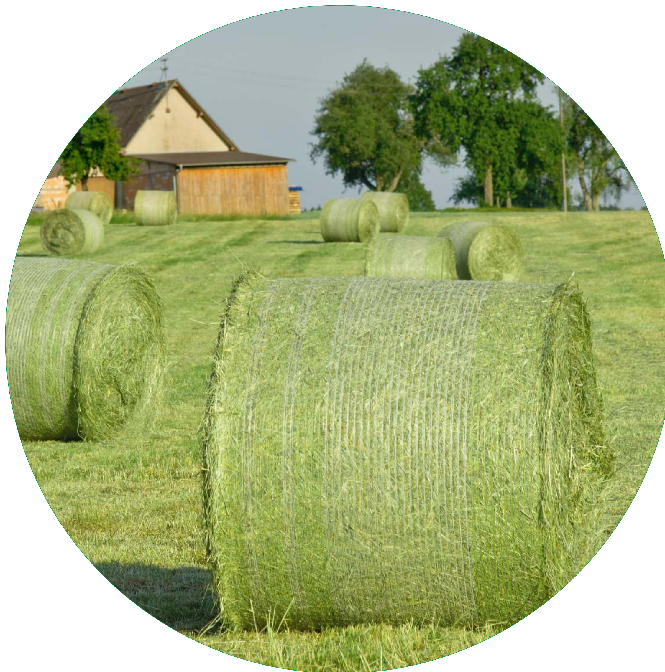
Good Quality Grass