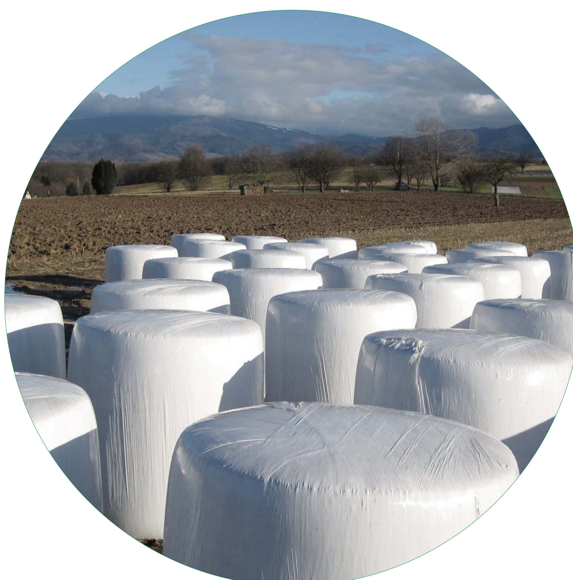
Excellent Bale Quality