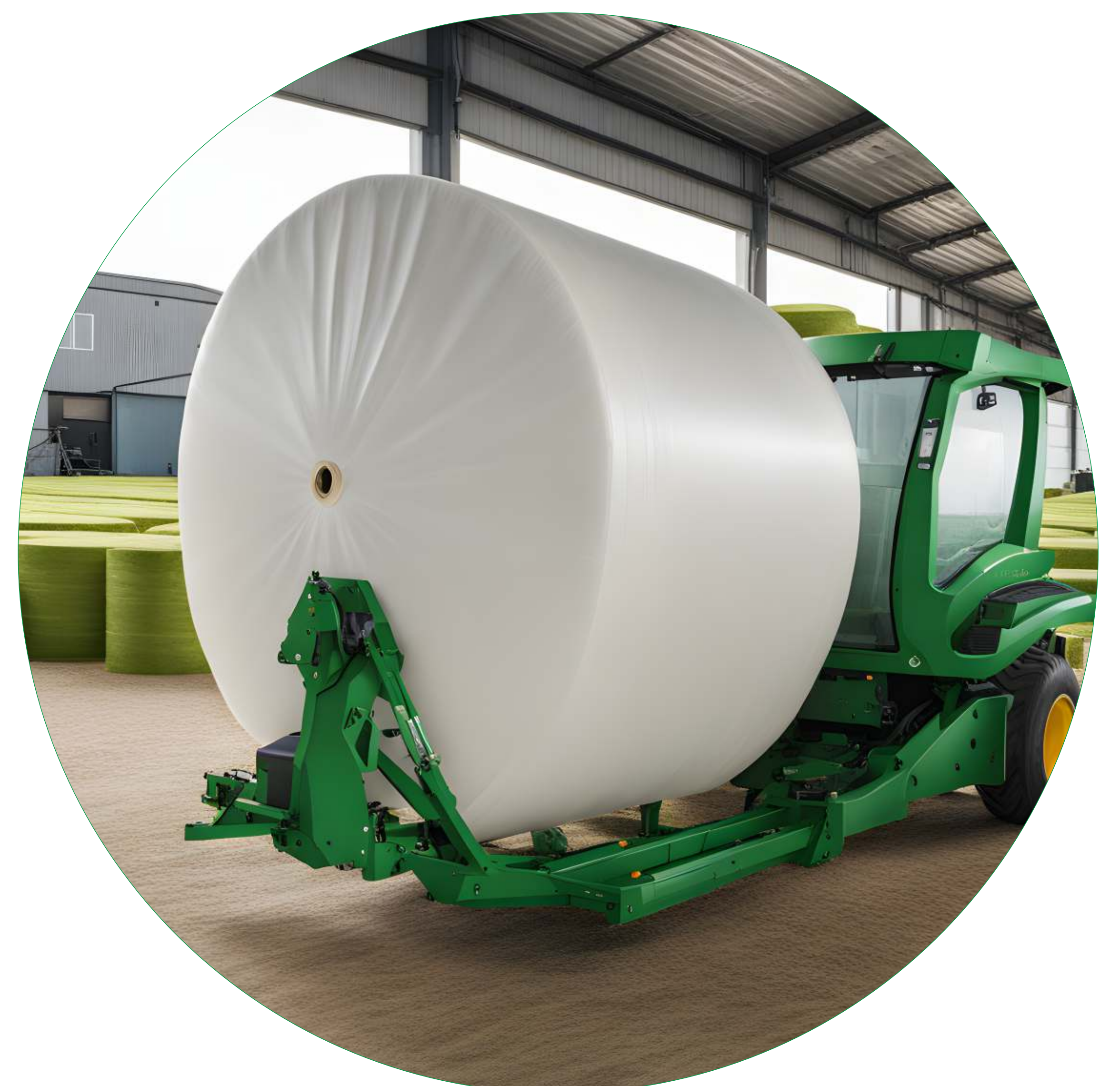
Excellent Bale Wrapping