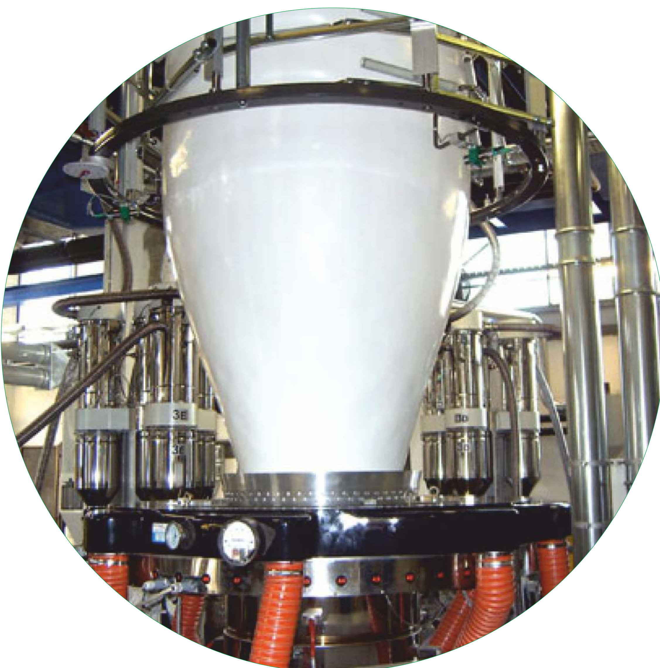
5/7 Layers Extrusion Production Line