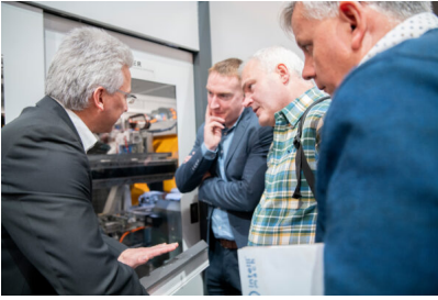
Caption 1: At Fensterbau Frontale, visitors can experience a PVC and an aluminium processing centre live under production conditions. This gives a realistic impression of the precision, speed and flexibility of Schirmer's profile processing centers.