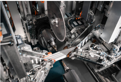
Caption 3: Each module contains two opposing 5-axis milling heads that operate simultaneously, each with a tool changer, and a saw from above. The profile is clamped only once for all work steps. At Frontale 2026, Schirmer will be demonstrating its expertise in highly automated aluminium profile processing.