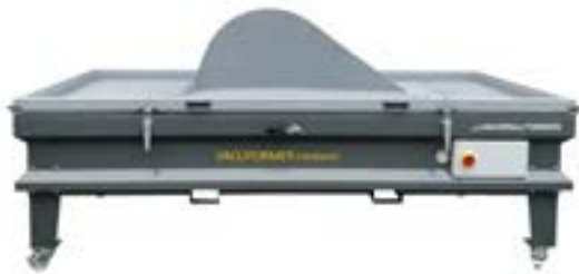
VACUFORMER S, L, XL and FOLD CUSTOMISED SIZES AVAILABLE!