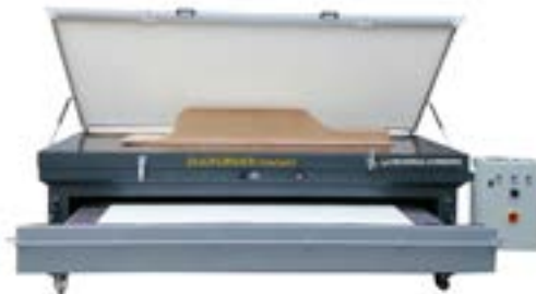
DUOFORMER STANDARD, MAXI, MEGA