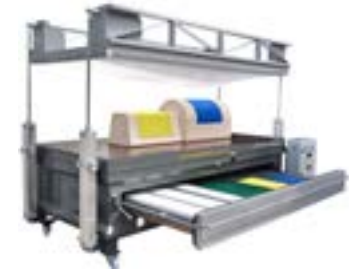
DUOFORMER VERTICAL, MAXI, MEGA