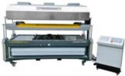
ULTRAFORMER STANDARD, FOIL, PERFECT