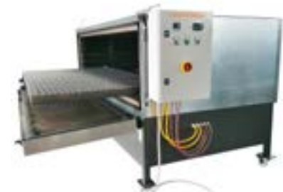
THERMOFORMER EDUCATION, STANDARD, MEGA