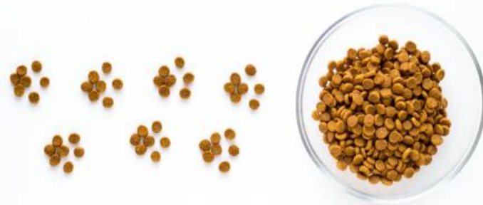
AMN Pea Protein Concentrate in high protein diets