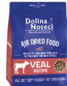
bag 1 kg

Composition: veal 36% (meat, hearts, liver, tripe), chicken 29% (meat, hearts, liver, gizzards), pork 15% (meat, lungs, kidneys), chicken fat, eggs, pea starch, minerals, salmon oil 0.8%, powder cellulose, spinach, chokeberry, bird cherry, Plantago seed, dried brewer's yeast (containing prebiotics: mannan-oligosaccharides and β-glucans), lecithin, chicory inulin (prebiotic), linseed, Mojave yucca, spirulina, New Zealand green-lipped mussel, hemp seeds, green tea, dried oregano 0.01%. Technological additives: natural antioxidants (tocopherols, rosemary extract). Analytical constituents: crude protein – 41%, crude fat – 20%, crude ash – 8%, crude fibre – 3%, moisture – 8%. Additives: nutritional additives/kg: Vitamin D3 – 240 IU, Vitamin E – 95 mg, Vitamin C – 50 mg, Zinc (zinc chelate of glycine, hydrate; zinc oxide) – 13 mg, Copper (copper (II) sulphate, pentahydrate) – 2 mg, Manganese (manganous sulphate, monohydrate) – 0.5 mg, Iodine (calcium iodate, anhydrous) – 0.4 mg, Taurine – 800 mg. Metabolic energy in 100 g: 384 kcal.