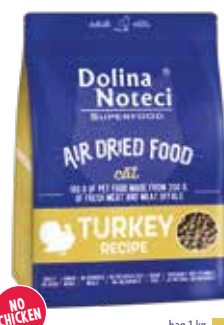
bag 1 kg