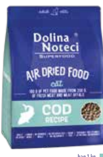
bag 1 kg