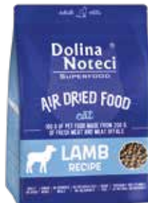
bag 1 kg

Composition: lamb 26% (meat, liver, hearts), beef 26% (meat, hearts, tripe), chicken 18% (meat, hearts, liver), pork 10% (meat, lungs, kidneys), chicken fat, eggs, pea starch, minerals, salmon oil 0.8%, powder cellulose, spinach, banana, wild rose, Plantago seed, dried brewer's yeast (containing prebiotics: mannan-oligosaccharides and β-glucans), lecithin, chicory inulin (prebiotic), linseed, Mojave yucca, spirulina, New Zealand green-lipped mussel, hemp seeds, nettle, dried camomile 0.01%. Technological additives: natural antioxidants (tocopherols, rosemary extract). Analytical constituents: crude protein – 41%, crude fat – 20%, crude ash – 8%, crude fibre – 3%, moisture – 8%. Additives: nutritional additives/kg: Vitamin D3 – 240 IU, Vitamin E – 95 mg, Vitamin C – 50 mg, Zinc (zinc chelate of glycine, hydrate; zinc oxide) – 13 mg, Copper (copper (II) sulphate, pentahydrate) – 2 mg, Manganese (manganous sulphate, monohydrate) – 0.5 mg, Iodine (calcium iodate, anhydrous) – 0.4 mg, Taurine – 800 mg. Metabolic energy in 100 g: 384 kcal.