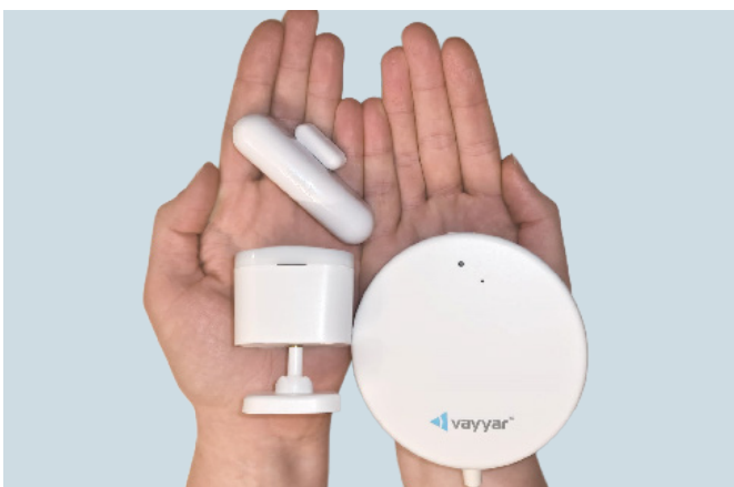
The sensors are small and blend seamlessly into the home.

It also supports daily life with a range of additional functions, such as medication, appointment, and drinking reminders, and by initiating conversations. All of this without any complicated controls – through Vivi, the voice assistant.