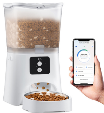
Automatic Pet Feeders