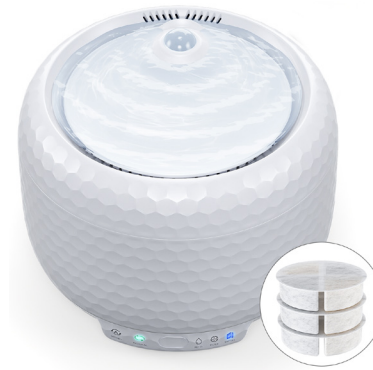
Automatic Pet Fountain

With 2.4G/5G WiFi and Bluetooth, this smart feeder dispenses freeze-dried food smoothly, avoiding clogs. It features HD night vision, remote interaction, and multi-layer fresh-locking for timed, precise feeding.