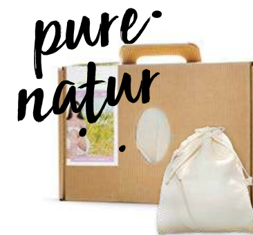
Hay flower full bath