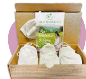
Hay flower sitz bath