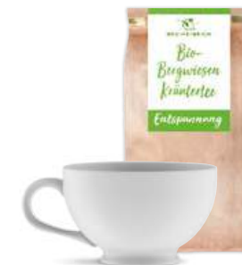
Organic mountain meadow herbal tea