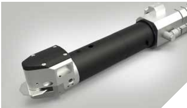
PRT – Driven rotating blade up to 11,000 rotations/min