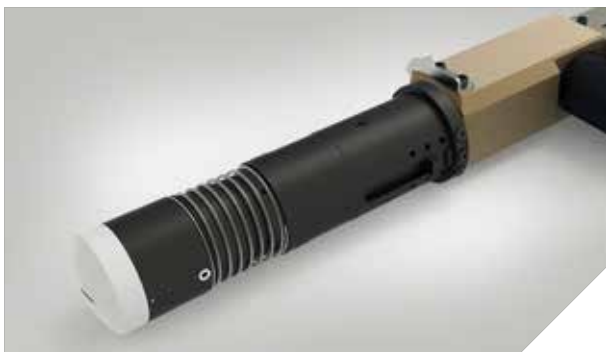
EOT – Oscillating blade up to 15,000 rotations/min