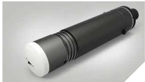
UCT – Straight knife tangentially controlled