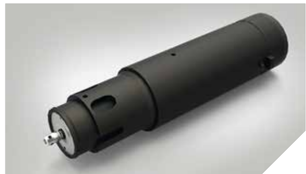
KCT – Kiss-Cut Tool cuts into the surface, not into the substrate