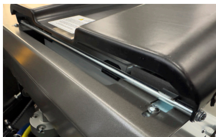
ROBUST EASY TO REMOVE HOOD