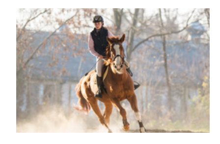
Outdoor riding and hiking