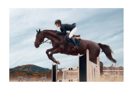
Competition and training arenas