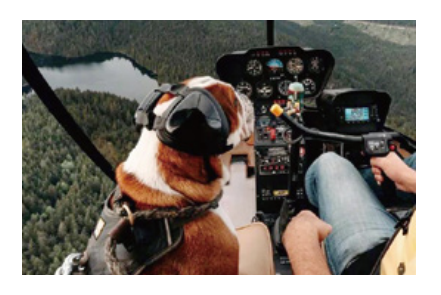
Travel by plane or helicopter