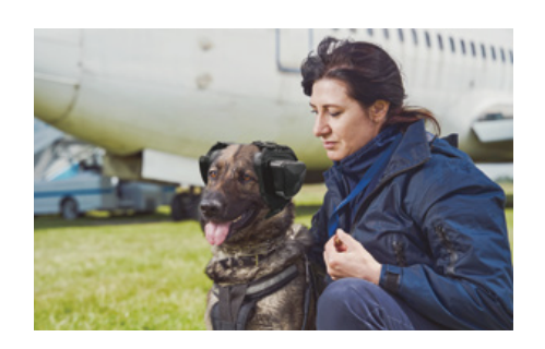
PetEar DE-01 Dog & Cat Earmuffs