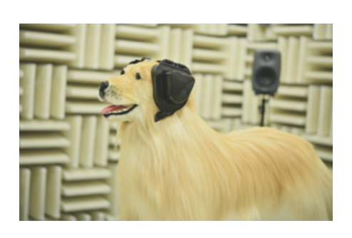
About us Hearing Protection