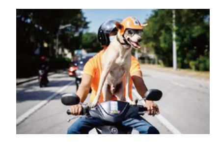
Riding by motorcycle