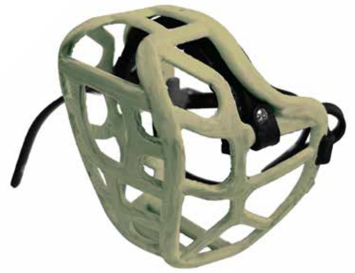
PROTOTYPE SHOWING COLOUR