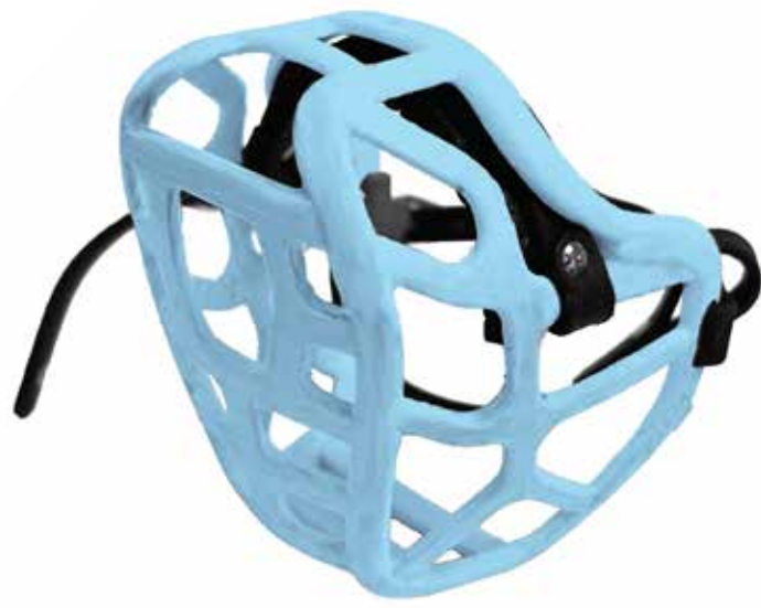
PROTOTYPE SHOWING COLOUR