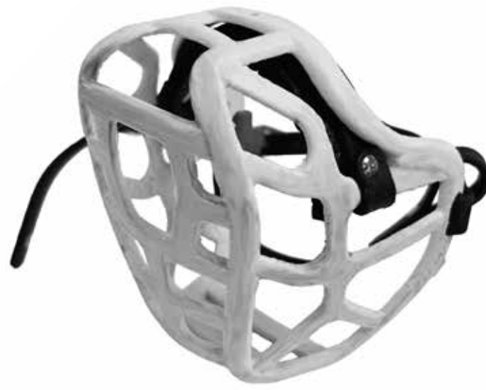
PROTOTYPE SHOWING COLOUR