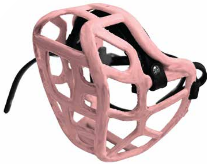
PROTOTYPE SHOWING COLOUR