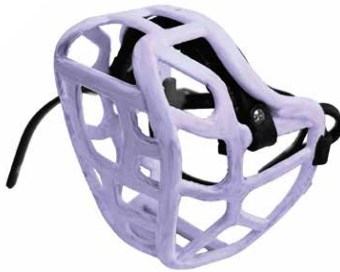
PROTOTYPE SHOWING COLOUR