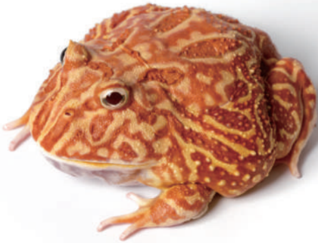
· Orange Red line