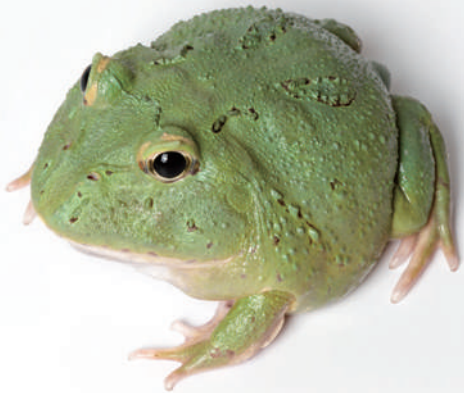
· Normal Matcha