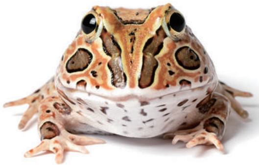
· Red Pacific Horned Frog