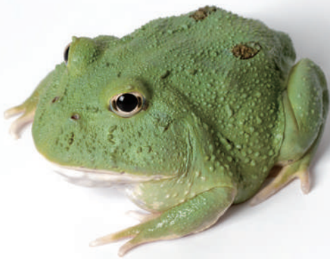
· 2-spots Matcha