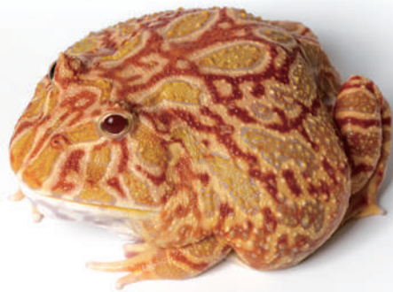
· Blood Red line

Strawberry Horned Frog have two distinct bloodlines. One is the Blood Red Strawberry, characterized by deep, blood-red dorsal striping with striking contrast. The other is the Orange Strawberry, featuring a uniform orange-red body coloration that offers a softer yet equally eye-catching appearance.