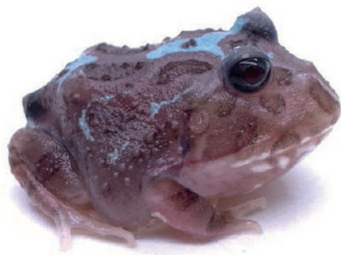
Metal Blue + Translucent + Eclipse eyes