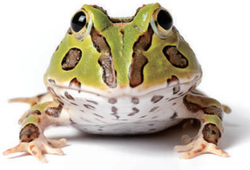
· Green Pacific Horned Frog